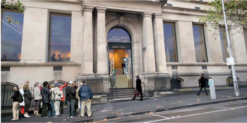
VIEW FROM RUSSELL STREET

The designs for these and other Vision 2020 project spaces are by internationally acclaimed firms Architectus and Denmark's Schmidt Hammer Lassen.