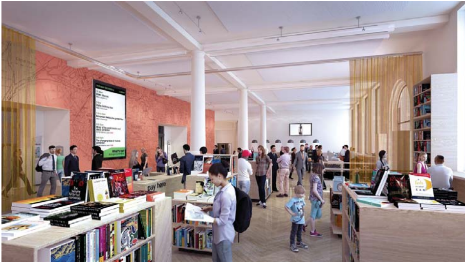
BALDWIN SPENCER PROPOSED INTERIOR