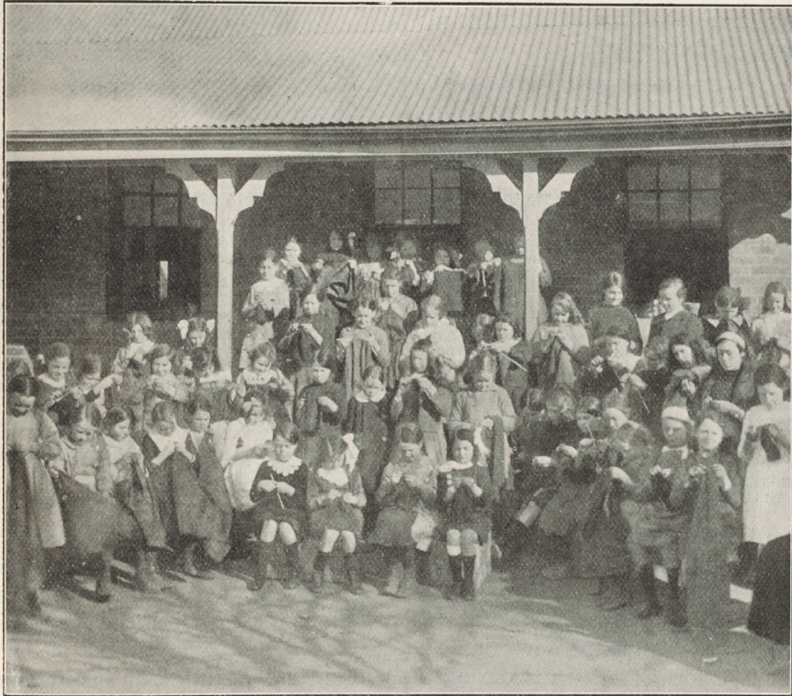
CHILDREN AT A VICTORIAN STATE SCHOOL MAKING GARMENTS FOR THE TROOPS.

Cho-rus ( ko-rus ), here, sound produced by a number acting together