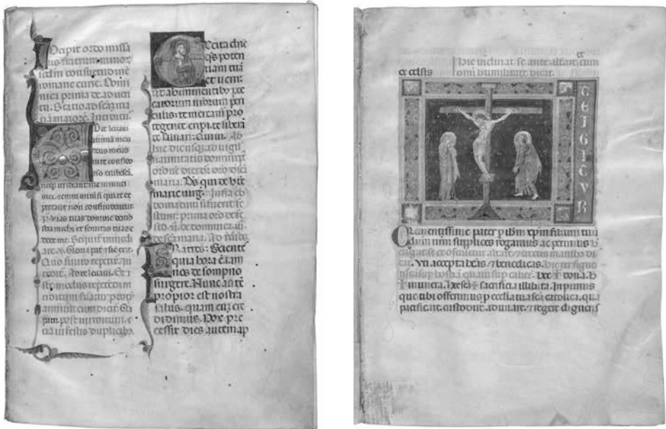
Two folios from the Codex Sancti Paschalis : the Christ in Majesty initial, f. 7r, and the Crucifixion miniature, f. 182r.