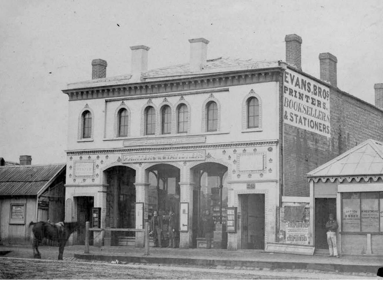
'Lydiard Street Ballarat' showing the Evans Bros Printers, Booksellers and Stationeers business.