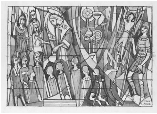
Alan Sumner, 'Presentation sketch, St. Laurence ', c.1974. Alan Sumner Collection, State Library of Victoria. Reproduced courtesy of the Estate of Alan Sumner