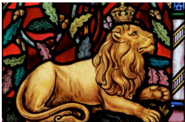
Ferguson and Urie, Memorial to Albert, Prince Consort, 1874.

Detail (bottom left panel) from the above