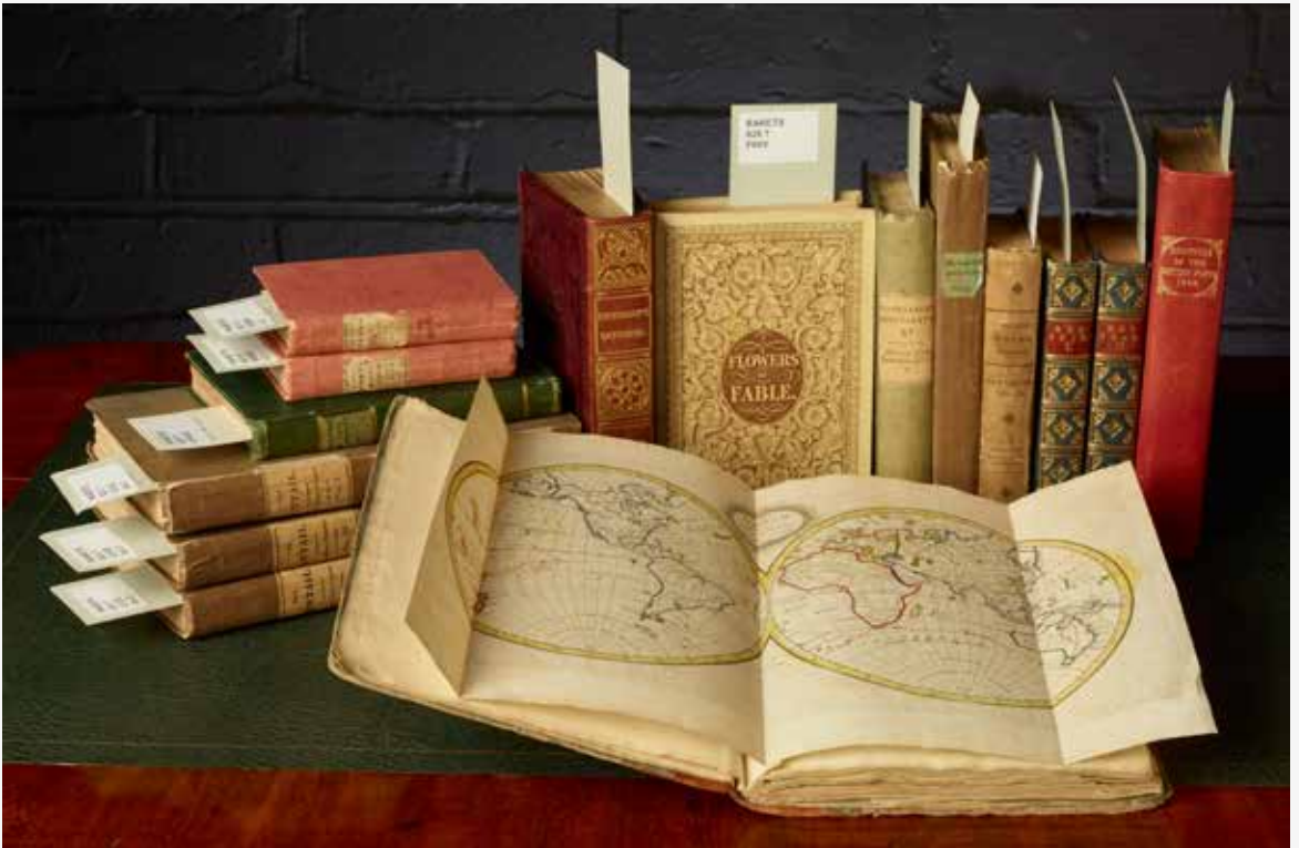
Selection of books from the Thomas Scott Collection. Rare Books Collection