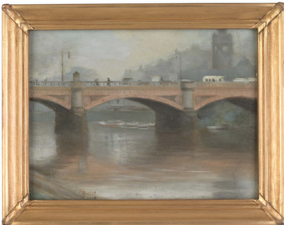
Clarice Beckett, Princes Bridge , oil on pulpboard, 29.5 x 39.7 cm, circa 1924–1926, H2006.176. Purchased with the assistance of the State Library Victoria Foundation, 2006.

As of late 2023, the painting is on display in the Library's Cowen Gallery and can be viewed whenever the Library is open. The gallery houses a permanent exhibition of selected artworks from the Library's Pictures Collection.