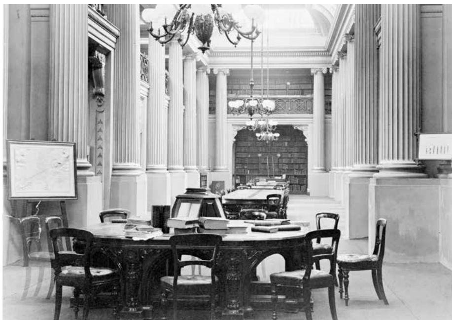
The Queen's Hall Reading Room, Melbourne Public Library, c. 1870–1900, albumen silver photograph, Pictures Collection, H4573