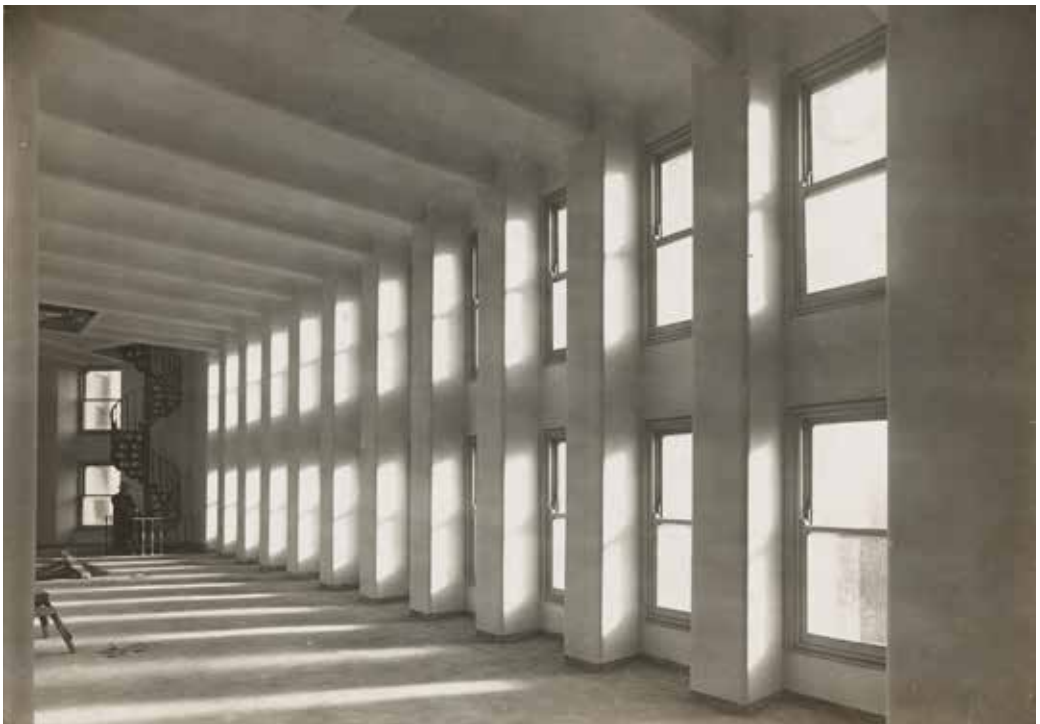
Sears' Studios, photographer, Annulus of domed reading room, under construction, Melbourne Public Library, c. 1913, Pictures Collection, H9214

closely connected with literature, in the widest acceptance of the term, form a valuable adjunct to the printed volumes. The written word is sometimes of intrinsic value, possibly even more so than a first edition. There is a personal touch about manuscripts that has an appeal deeper than mere sentiment. It has also something of the quality of a good portrait and helps to put one in personal touch with the writer. The interest, too, increases with age. So it is well for a library to collect manuscripts of poets, and authors as well as men of real eminence in the world of art or state craft.