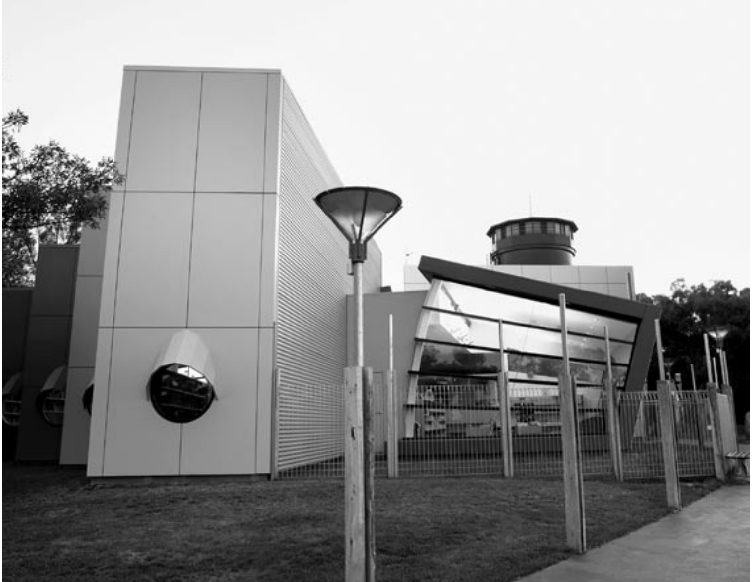
LIBRARIES DEVELOPING SOCIAL CAPITAL: THE NEW KERANG LIBRARY