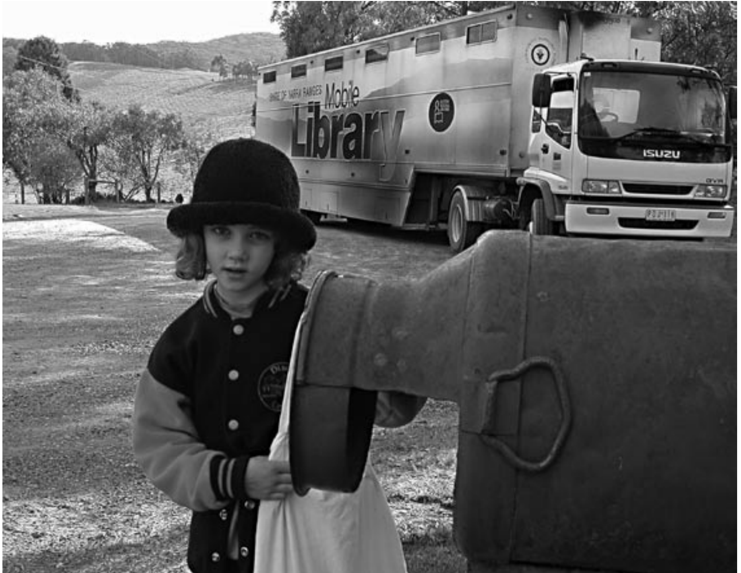
LIBRARIES REACHING OUT TO COMMUNITIES: THE YARRA RANGES MOBILE LIBRARY SERVICE