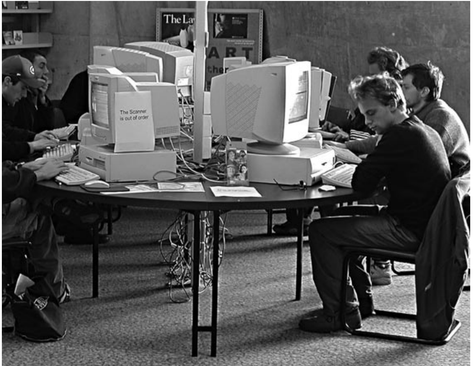
LIBRARIES PROVIDING A GATEWAY TO INFORMATION: PORT PHILLIP LIBRARY SERVICE INTERNET ACCESS