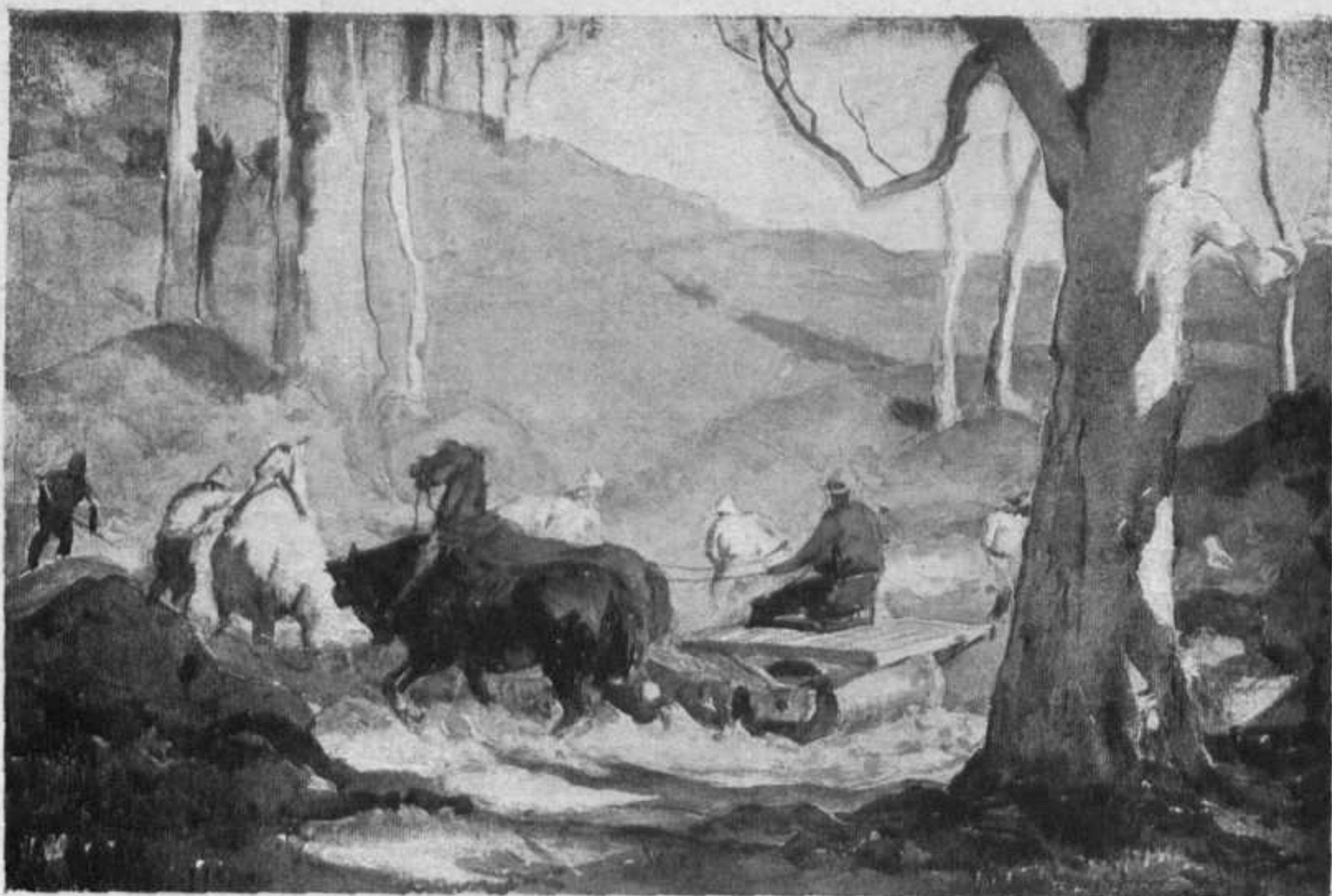
"THE THRESHING FLOOR."