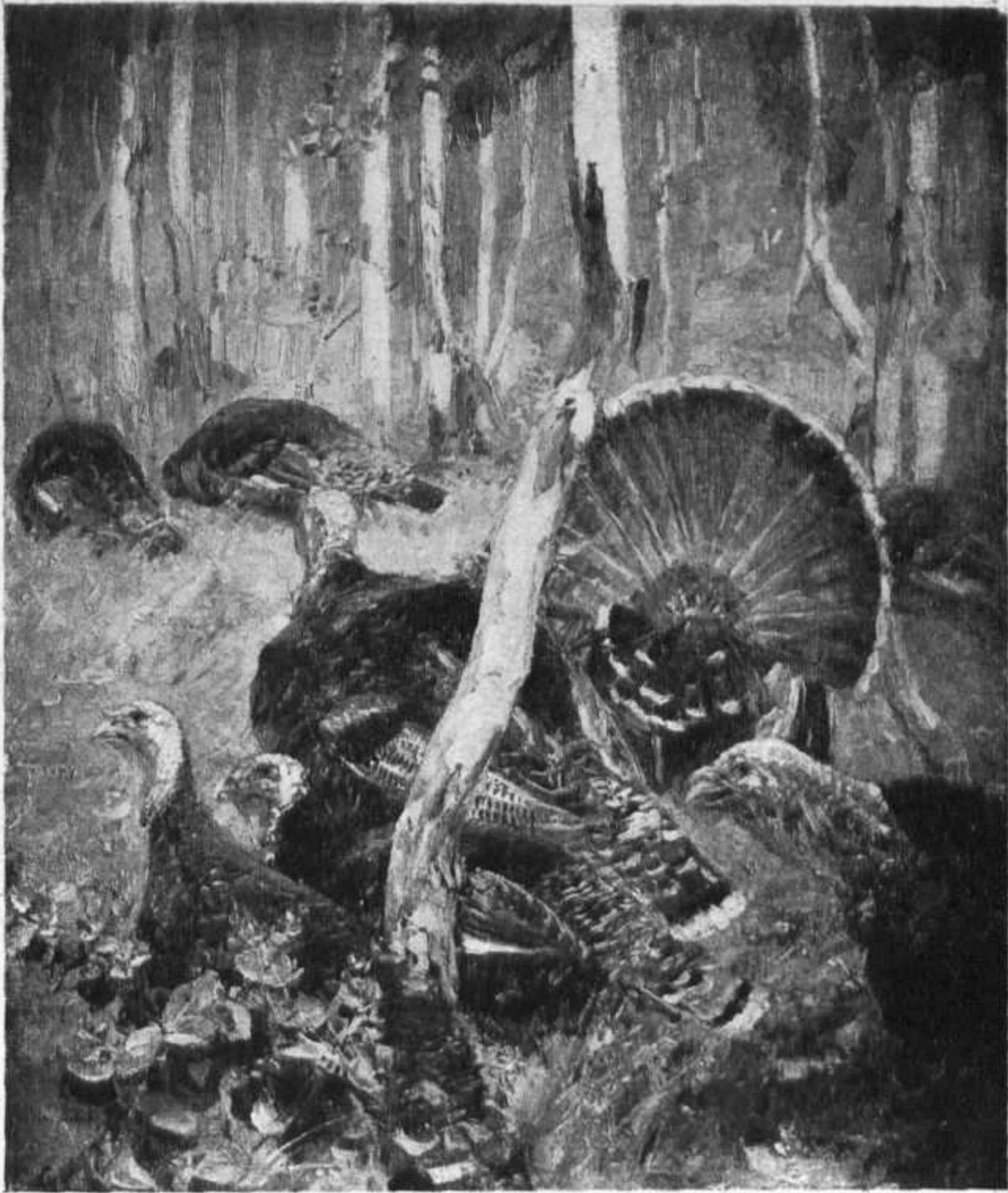
"A BUSH IDYLL."