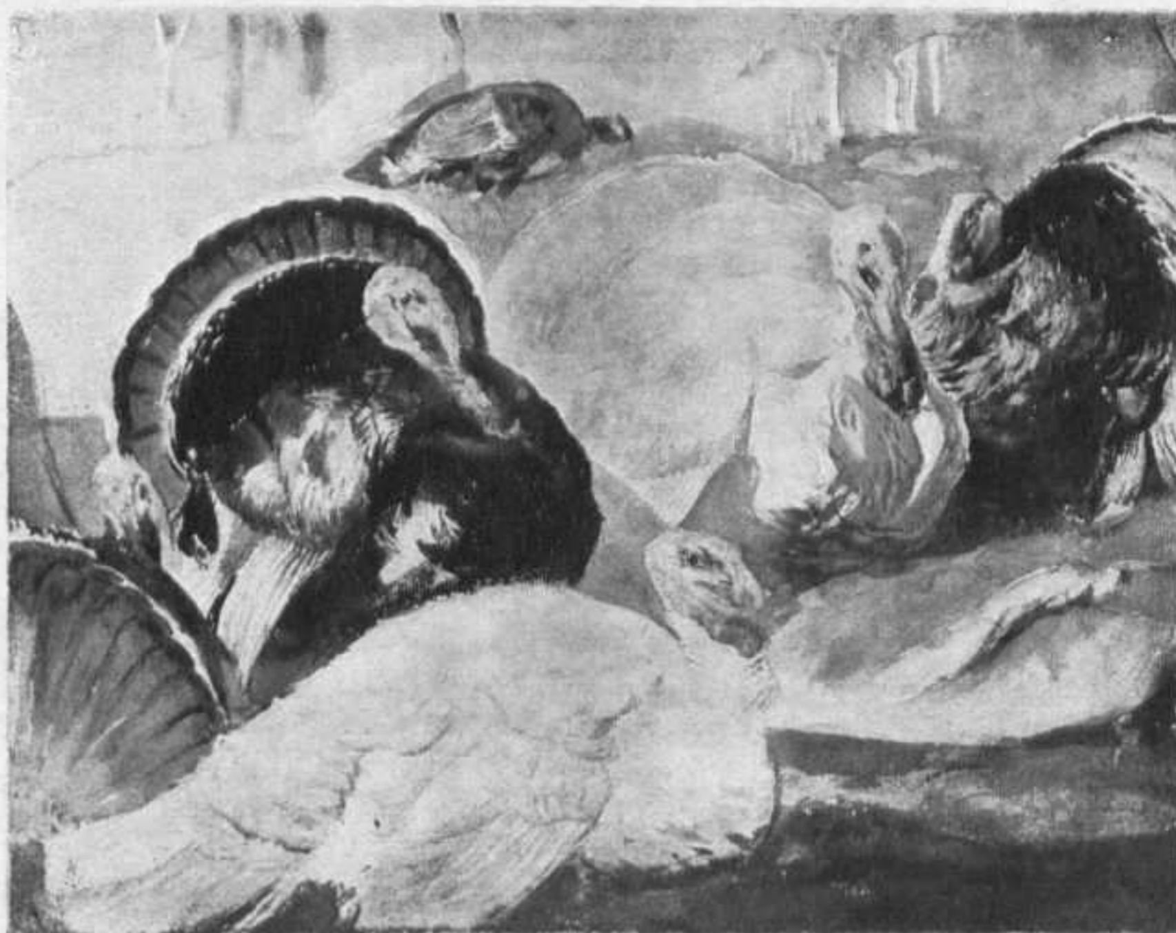
"BLACK AND WHITE."